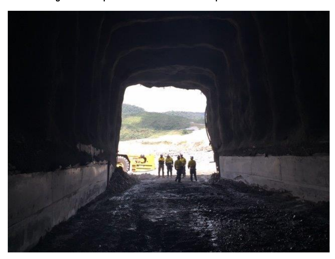
Figure 2 – Didipio Underground Development Work