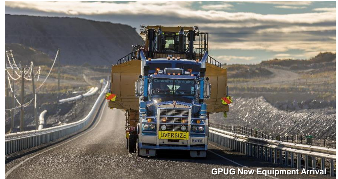
GPUG New Equipment Arrival

Golden Point UG On-track for first production in Q4 2021