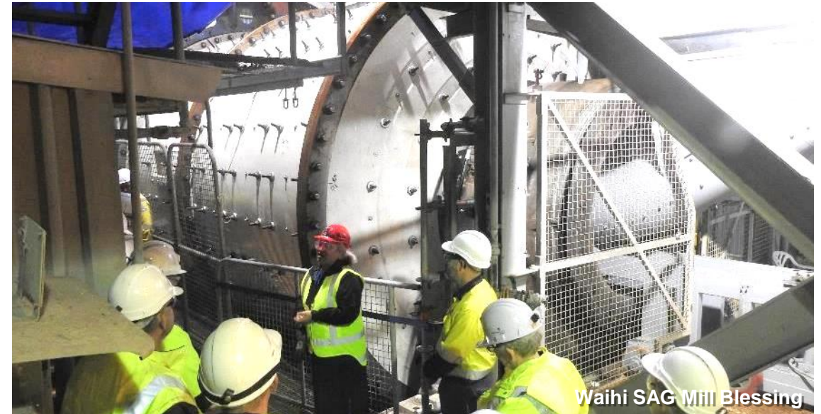
Waihi SAG Mill Blessing